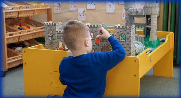
Expressive arts and design