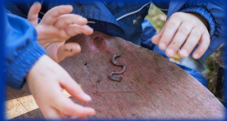
Understanding the World